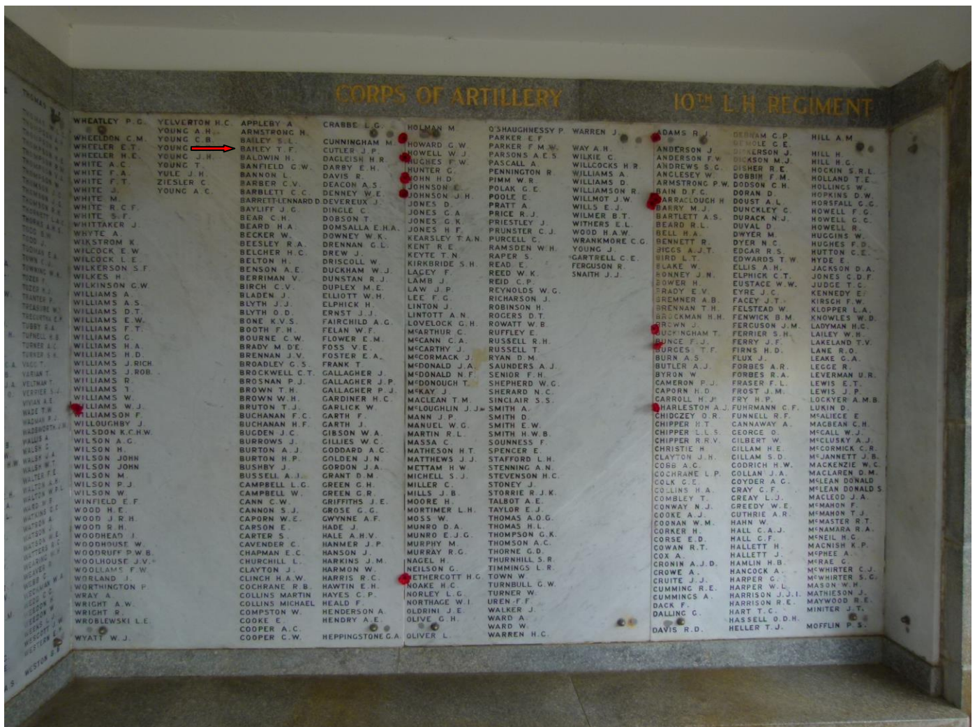
Corps of Artillery Panel